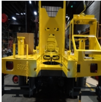
New Hyd Pumps & Motors