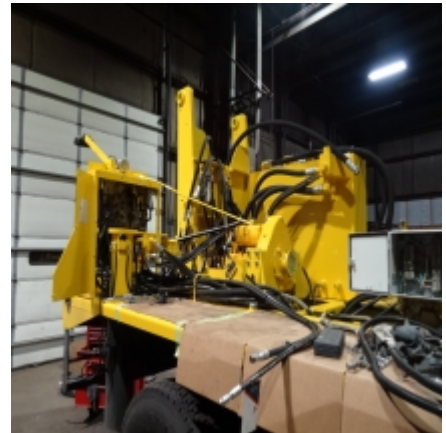
New Hyd & Air Hose